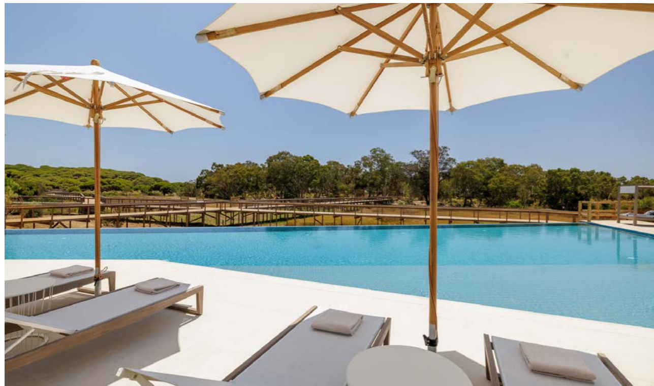
Verdelago Resort - Sustainable Beachfront Living in Castro Marim, Algarve, Portugal | Prices from €715,000

We also believe that the Algarve is experiencing a regional transition to become a sustainable all-year round investment destination and a remote working hub rather than just an area of discretionary seasonal holiday purchases.