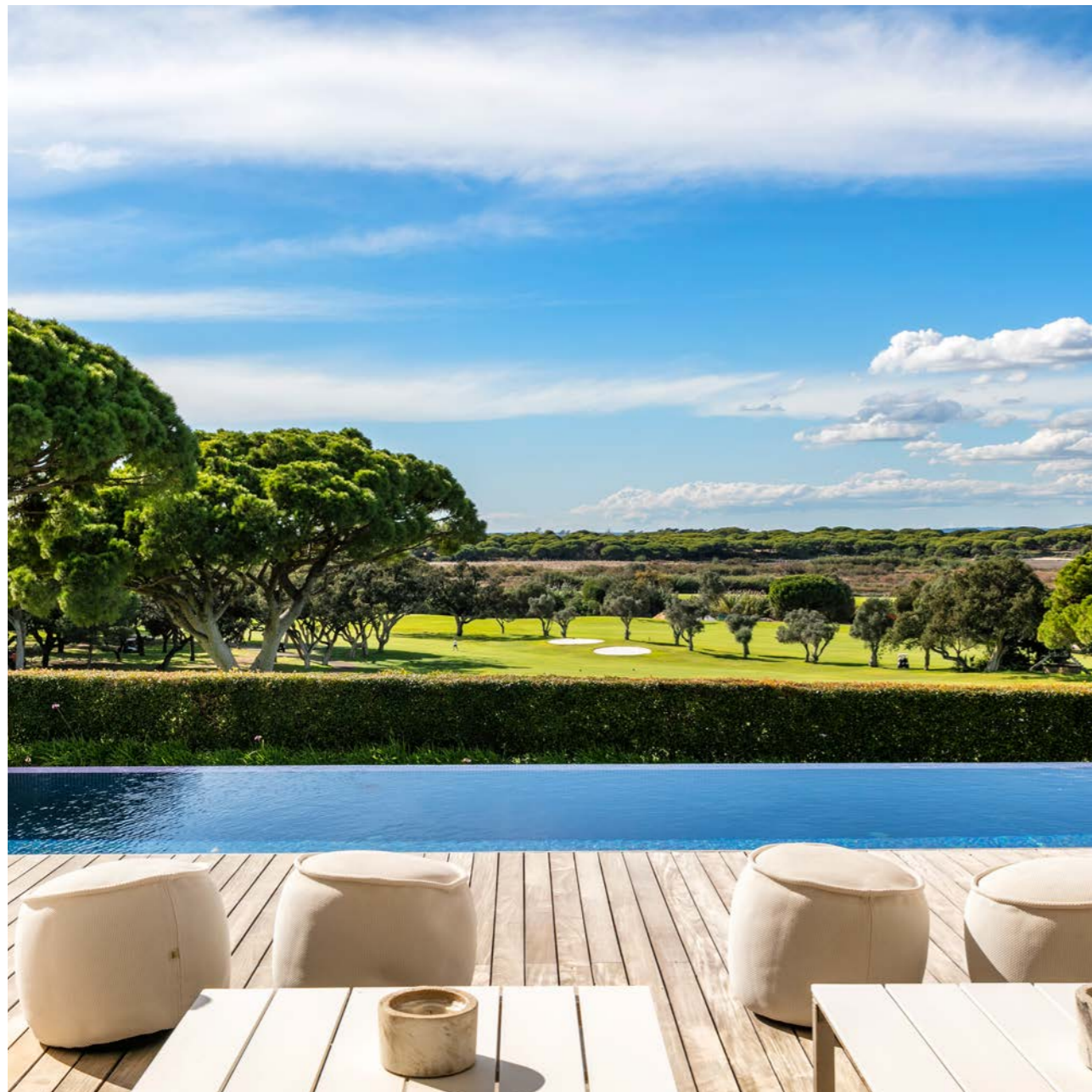
▶ Bright and Elegant Villa with Sea and Golf Views in Vale do Lobo, Algarve, Portugal | Ref 97407QP | €6,000,000

▶ €20K premium monthly rents can reach over this value