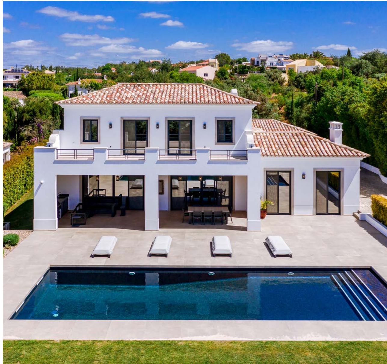
▶ Luxurious Villa in Vale Formoso, Algarve, Portugal | Ref 95620QP | €3,995,000

According to the latest Henley & Partners Private Wealth Migration Report , Portugal is expected to attract approximately 1,400 new high-net-worth individuals (HNWIs) in 2025, bringing around US $8.1B in wealth - placing it seventh globally for HNWI migration. Between 2014 and 2024, the number of foreign millionaires settling in Portugal rose by 38%. Portugal now ranks ahead of Greece, Canada, Japan, Monaco, and the Netherlands in terms of attractiveness to wealthy individuals. This trend is clearly visible in areas like Quinta do Lago and Vale do Lobo, which continue to appeal to the world's most affluent buyers thanks to their exceptional lifestyle offering and solid investment potential.