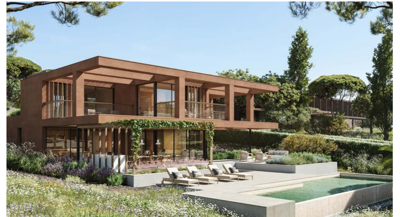
▶ Arcaya - Exclusive and Sustainable New Homes near Vilamoura, Algarve, Portugal | Prices from €2.75M