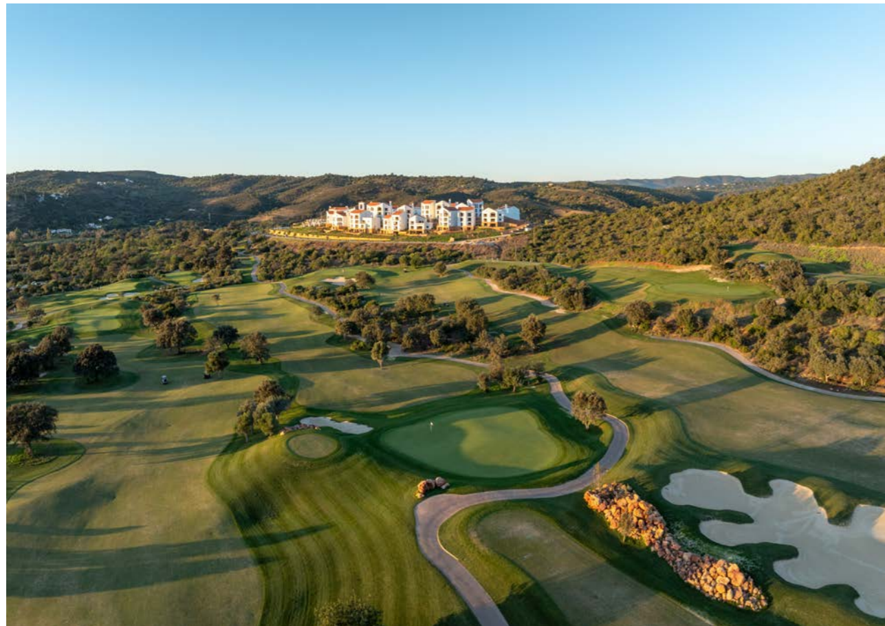
▶ Viceroy at Ombria Algarve - Exclusive apartments in Loulé, Algarve, Portugal | Prices from €781,200

A notable trend reshaping the market is the surge in branded residences. Over 700 branded units are set to launch in the Algarve over the next five years, with standout projects like Marriott's W and the Viceroy Residences at Ombria Algarve raising the bar in design, amenities, and service. While these properties command a 20-25% premium over standard homes, they offer buyers security, hassle-free management, and an enhanced lifestyle experience