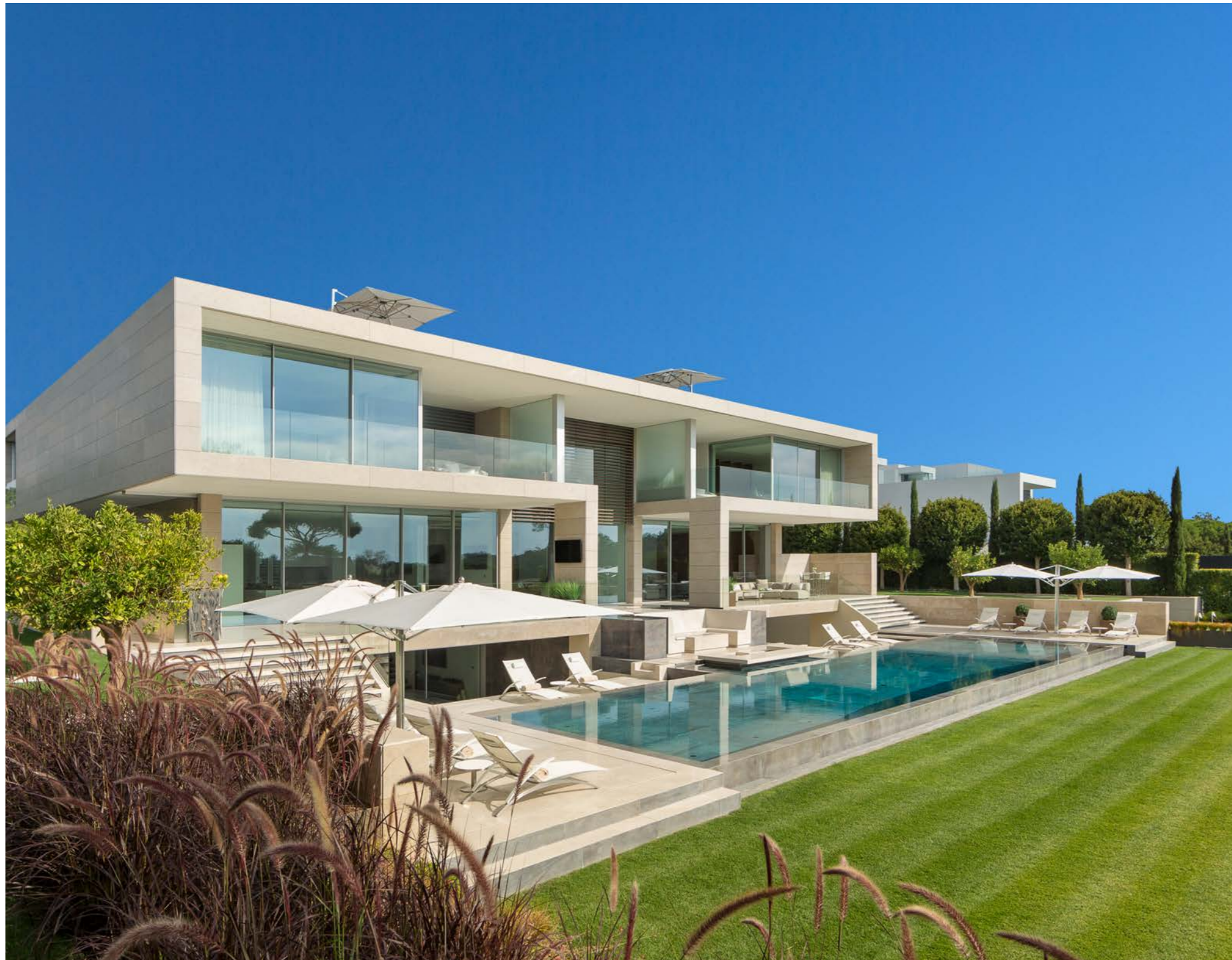
▶ One-of-a-Kind Masterpiece in Quinta do Lago, Algarve, Portugal | Ref 10002QP | P.O.A.