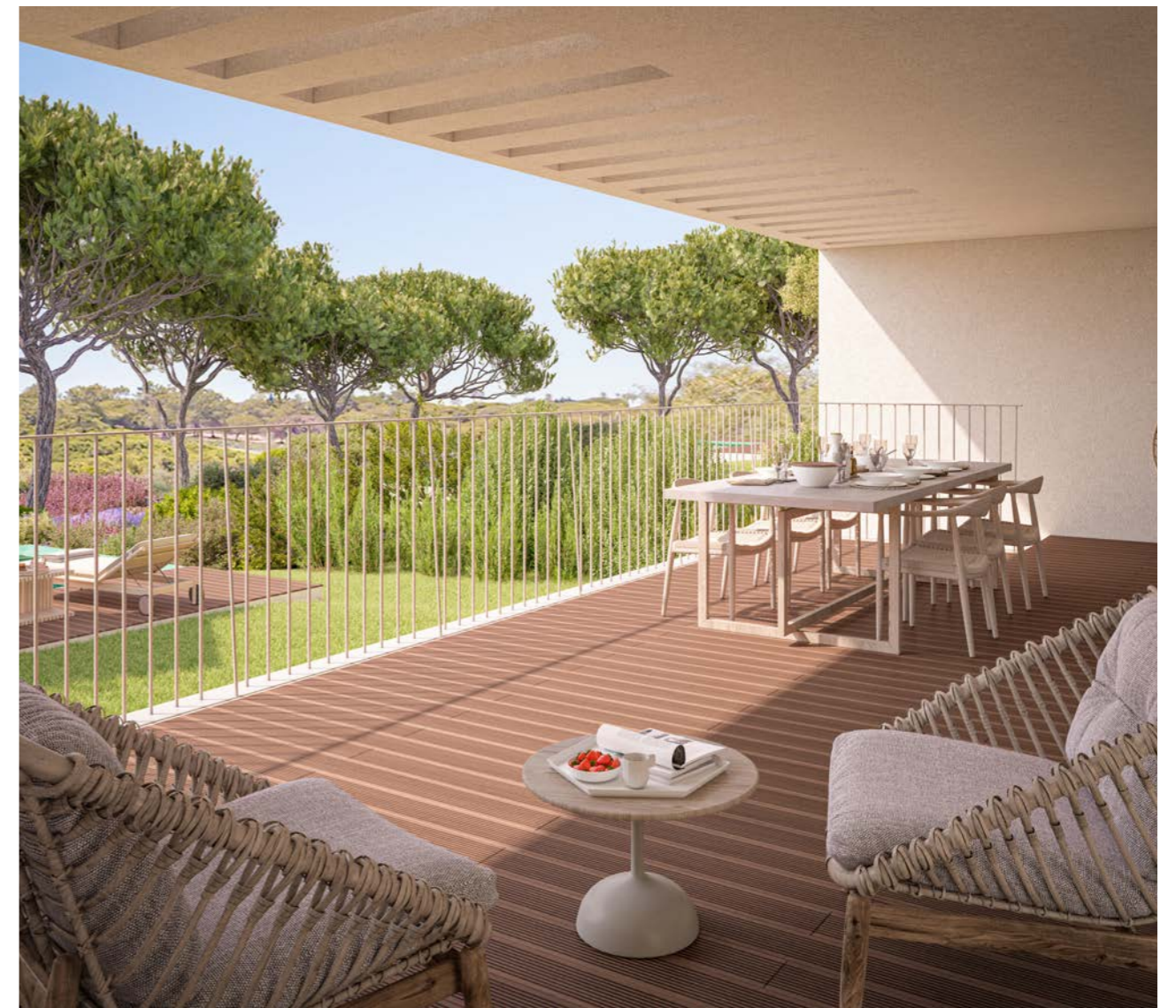
Atlantic Pines - Exquisite Villas in the Vale do Lobo Area, Algarve, Portugal | Prices from €2,000,000

In conclusion, while 2025 began with a little apprehension, it is fast becoming another busy and successful year. Demand is high, pricing is stable, and market sentiment is increasingly positive. The Algarve continues to shine as a safe, beautiful, and rewarding place to live and invest.