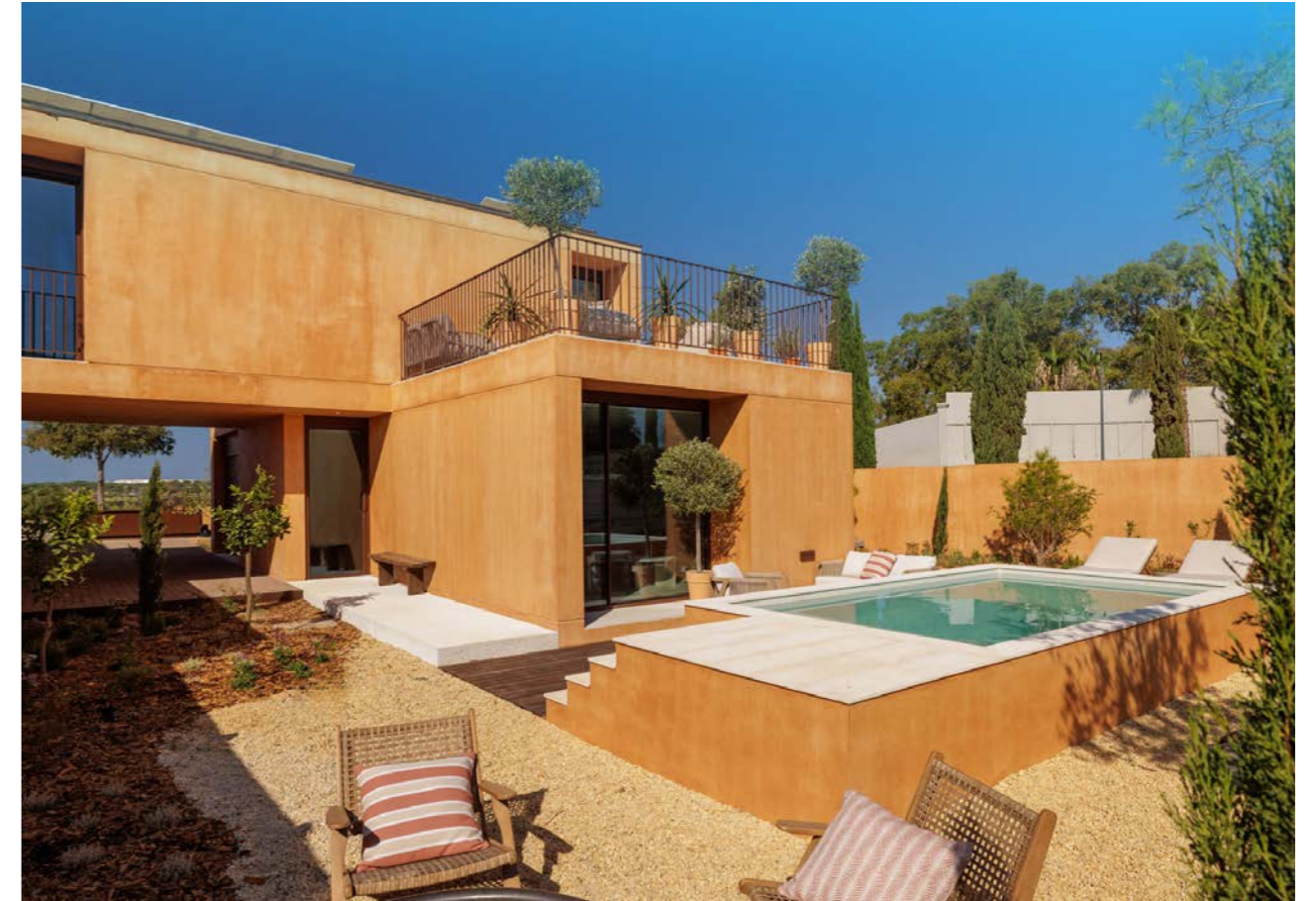
▶ Natura Village - Luxury Semi-Detached Villas in Vilamoura, Algarve, Portugal | Exclusively For Sale by QP Savills | Prices from €790,000